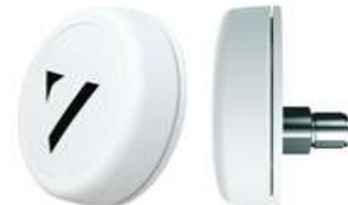
Optional GPS Module